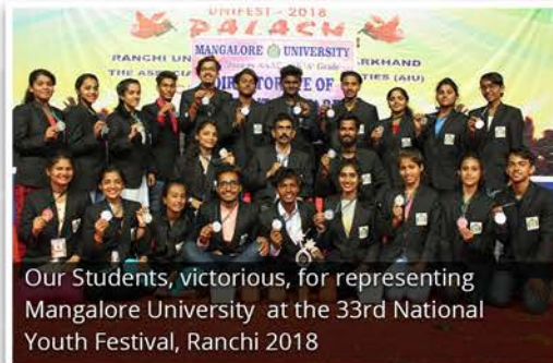
Our Students, victorious, for representing Mangalore University at the 33rd National Youth Festival, Ranchi 2018