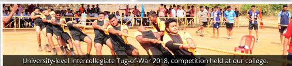
University-level Intercollegiate Tug-of-War 2018, competition held at our college.