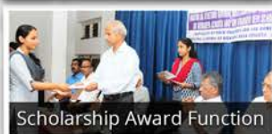
Scholarship Award Function