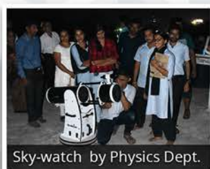
Sky-watch by Physics Dept.