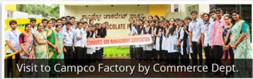
Visit to Campco Factory by Commerce Dept.